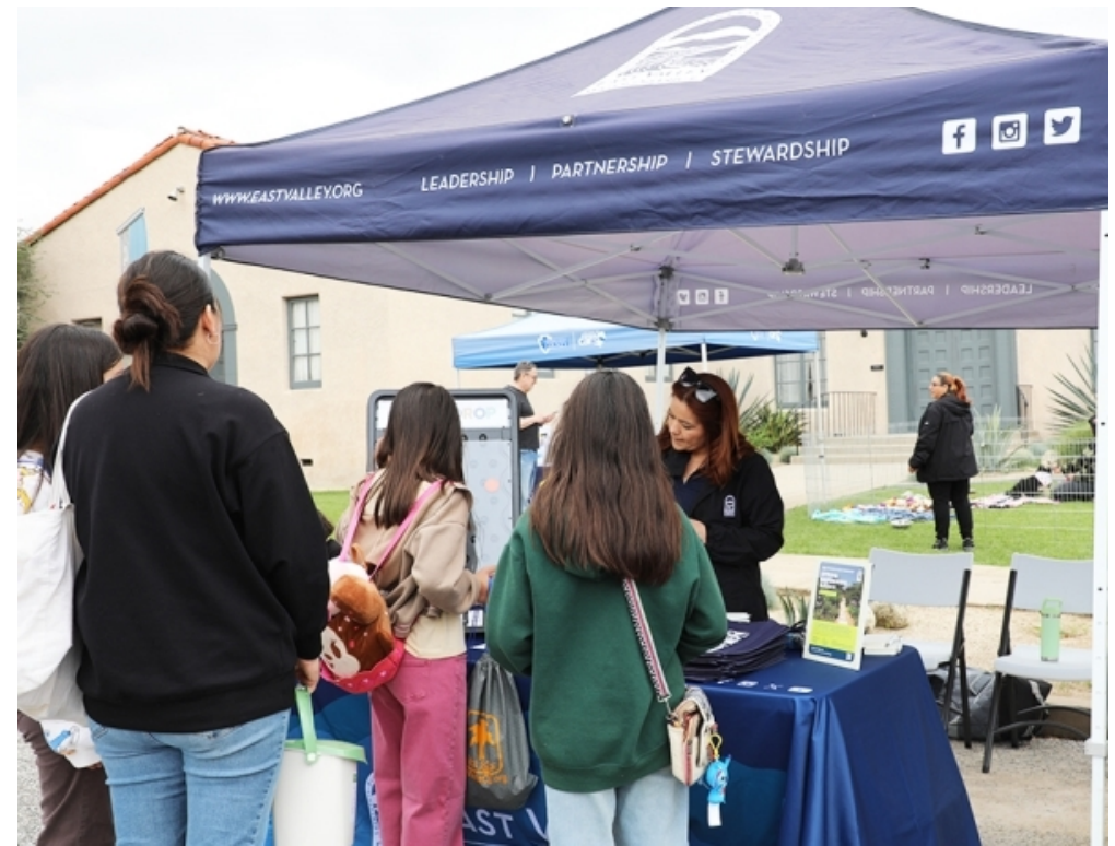
Citrus Harvest Festival