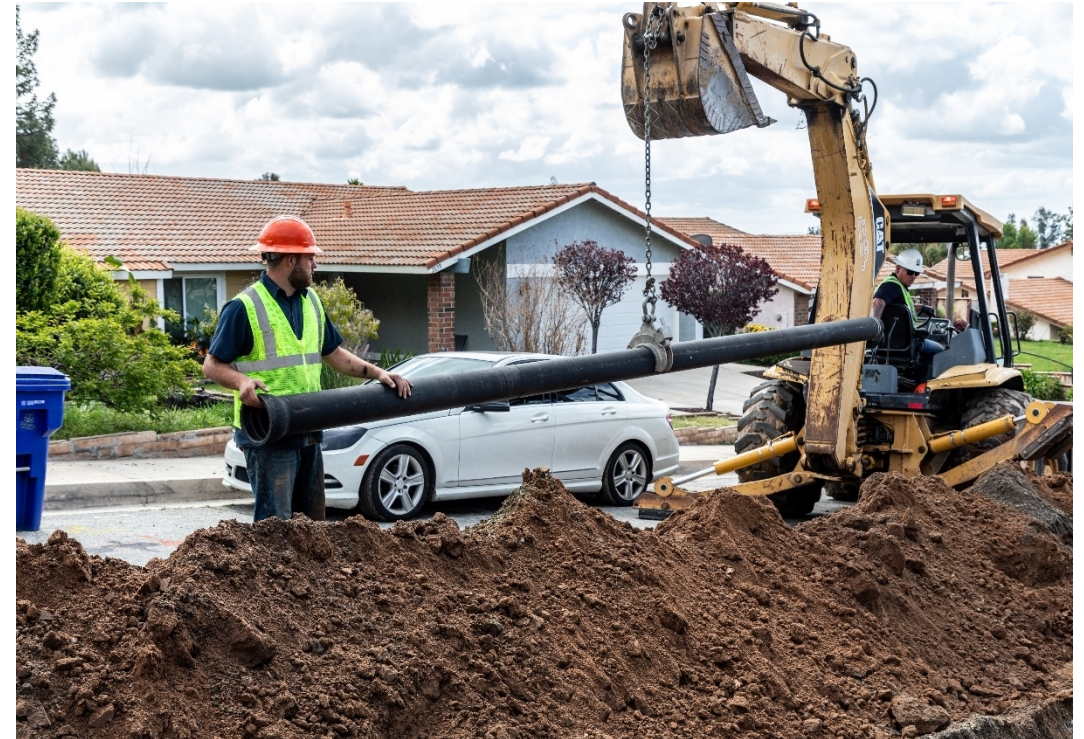
Oakridge Water Main Replacement Project