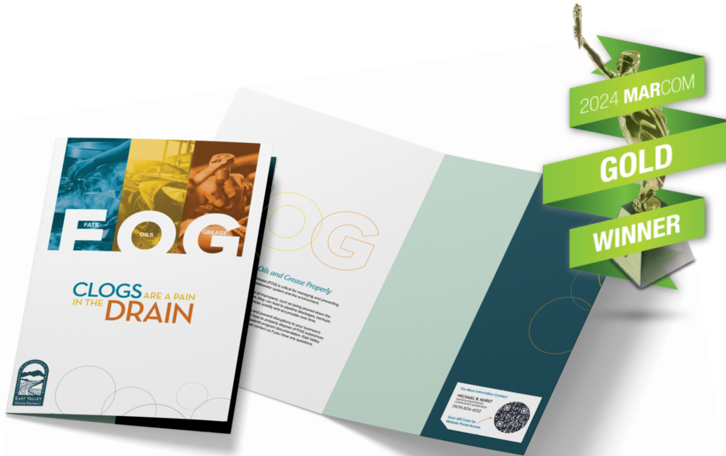
Educational Packet for Customers