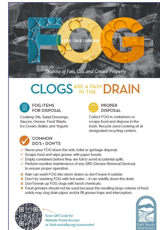
Do's and Don'ts Poster